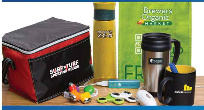
Use Promotional Products to Increase Leads and Stand Out Among Competitors.

Partner with PIP for all your promotional product needs to give customers and prospects something to remember you by.